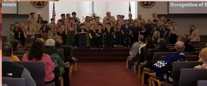
Scout Sunday at Christ the King Lutheran Church, Southgate MI.