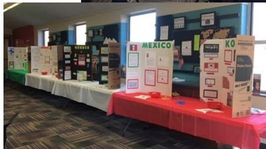
Display of accomplishments and service