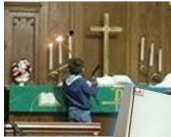
Cub Scout Pack 113 Celebrates Scout Sunday at Trinity Lutheran Church- LCMS Pueblo, Colorado at the Saturday Service. - photo submitted by Krayg Von Mosch