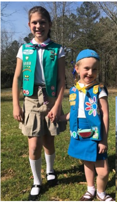
Ready to attend church Girl Scout Sunday 2020.