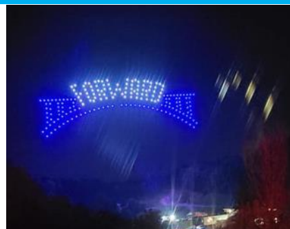
A shot of the Jambo Drone Show