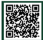
To Order Patches

For more information, check out these QR codes: