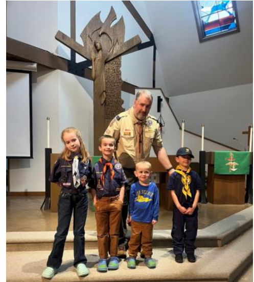
Pack 680, Spanaway, WA at Spanaway Lutheran Church.