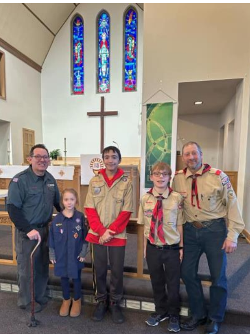
Scouts from Troop 46, Pack 146, and Crew 446 at Scout Sunday in Emmetsburg, IA.