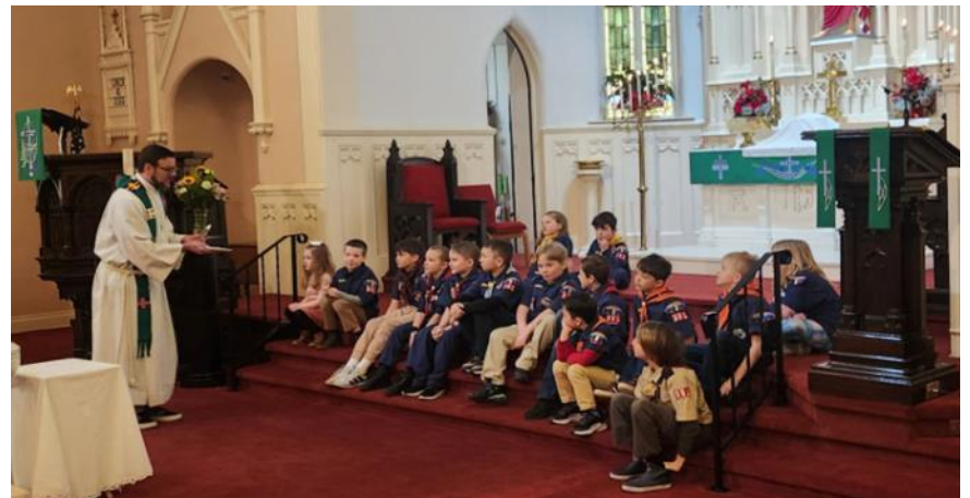
The scouts of Pack 361 Port Clinton Ohio at St John Lutheran took over the youth sermon!